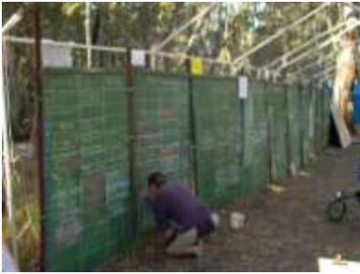
Workshops are run by anyone with something to share